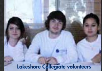
Lakeshore Collegiate volunteers